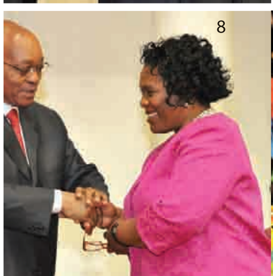
8. President Jacob Zuma and Deputy Minister of Energy Barbara Thompson