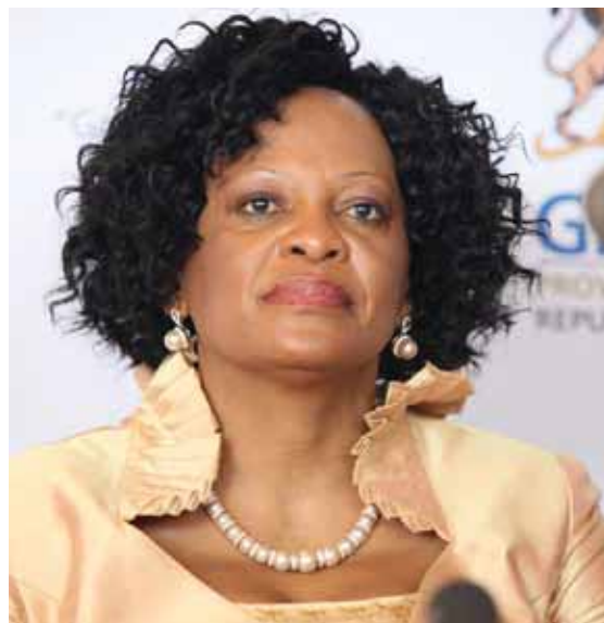
Gauteng Premier Nomvula Mokonyane

"Through the S'hambaSonke road maintenance project, we will capacitate 100 new contractors and create 6 500 jobs, benefiting cooperatives and companies owned by women, youth and people with disabilities."