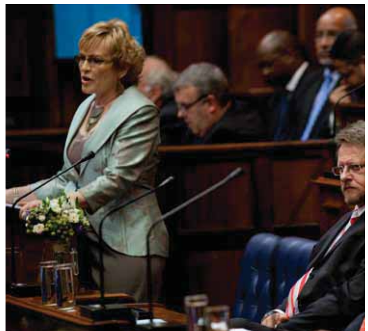
Western Cape Premier Helen Zille

A number of district hospitals and clinics have also recently been renovated and upgraded, including antiretroviral treatment facilities at the Cross Roads, Gugulethu and Retreat clinics, and repairs to district hospitals in Beaufort West, Vredendal and Riversdale. The Provincial Government will embark on a R1-billion revamp of Valkenberg Hospital. The project will be completed by July 2016.