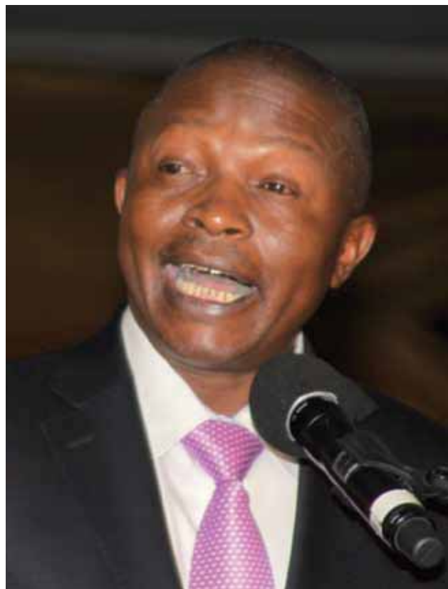
Mpumalanga Premier David Mabuza

The province is targeting the intake of 1 240 out-of-school youths into skills programmes, particularly in the