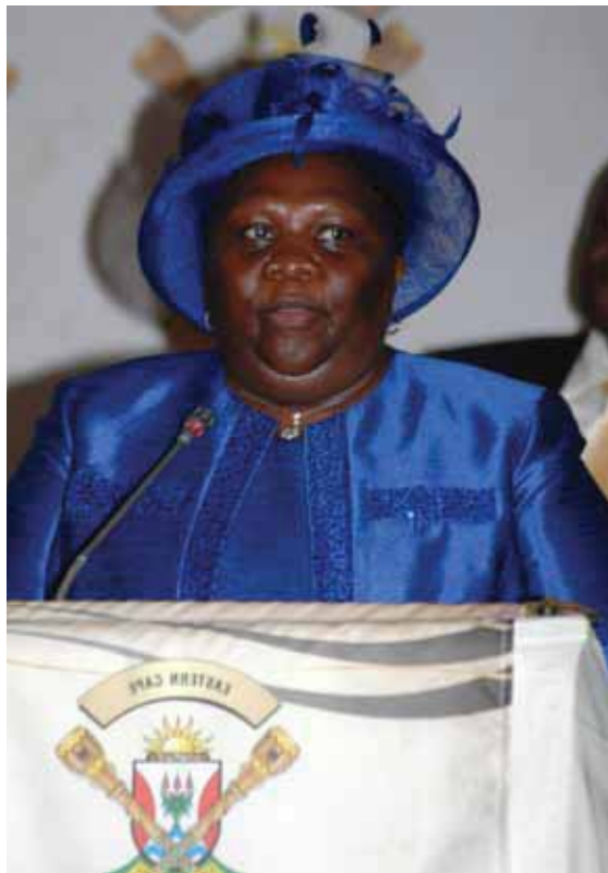
Eastern Cape Premier Noxolo Kiviet

The Eastern Cape Government supports cooperatives