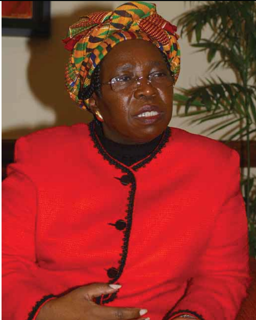
Minister Nkosazana Dlamini Zuma

Capacity building is a key focus area to ensure an efficient, effective and development-orientated public service. This includes an induction programme for newly appointed public servants, the training of unemployed youth graduates, building capacity for public-service innovation, and repositioning the Public Administration Leadership and Management Academy as a School of Government