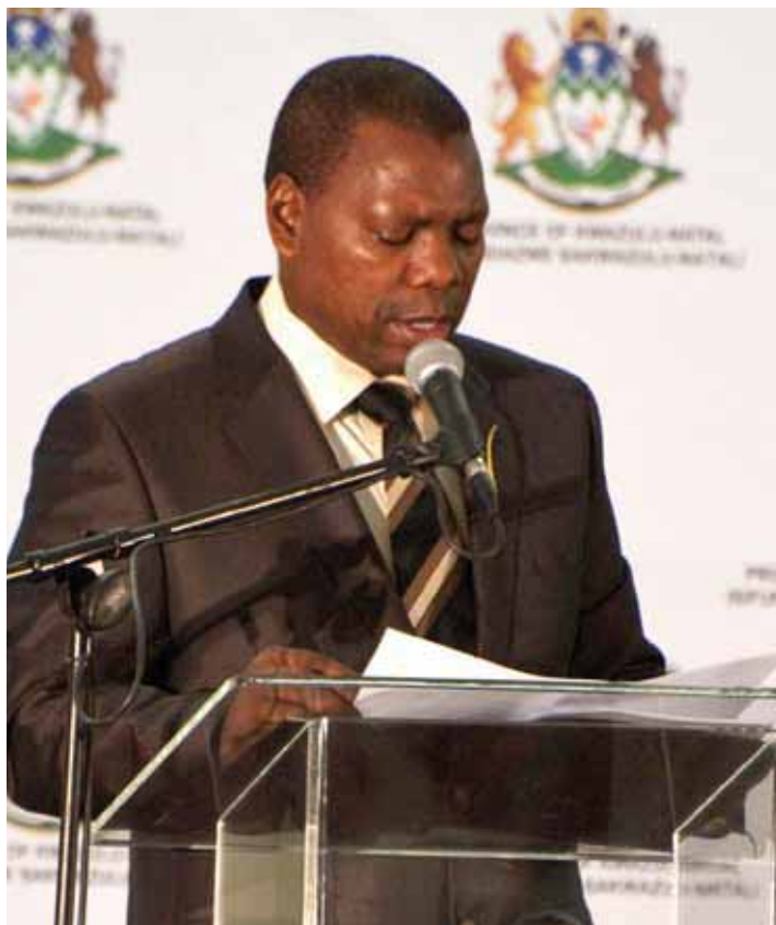
KwaZulu-Natal Premier Zweli Mkhize

Among the infrastructure projects earmarked for 2012/13 are construction and extension of health facilities in Estcourt, Madadeni Psychiatric Hospital and Empangeni, design of the John Dube Hospital and several clinics, while work already begun, such as construction at