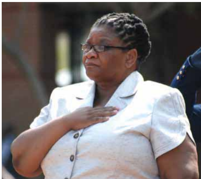
North West Premier Thandi Modise

Premier Thandi Modise said that work had started on the new Bophelong Psychiatric Hospital, with the project expected to be completed in 2012.