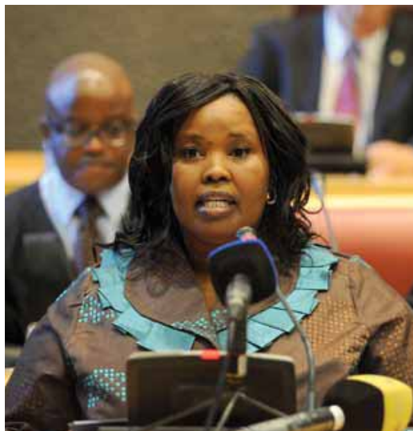
Northern Cape Acting Premier Grizelda Cjiekella

In addition, the following health infrastructure projects have been rolled out: the Mapoteng, Riemvasmaak, Boichoko and Grootmier clinics have been completed; the West End Hospital State Patients Unit has been upgraded; the Mental Health, De Aar and Upington hospitals and the Heuningvlei Clinic are under construction,