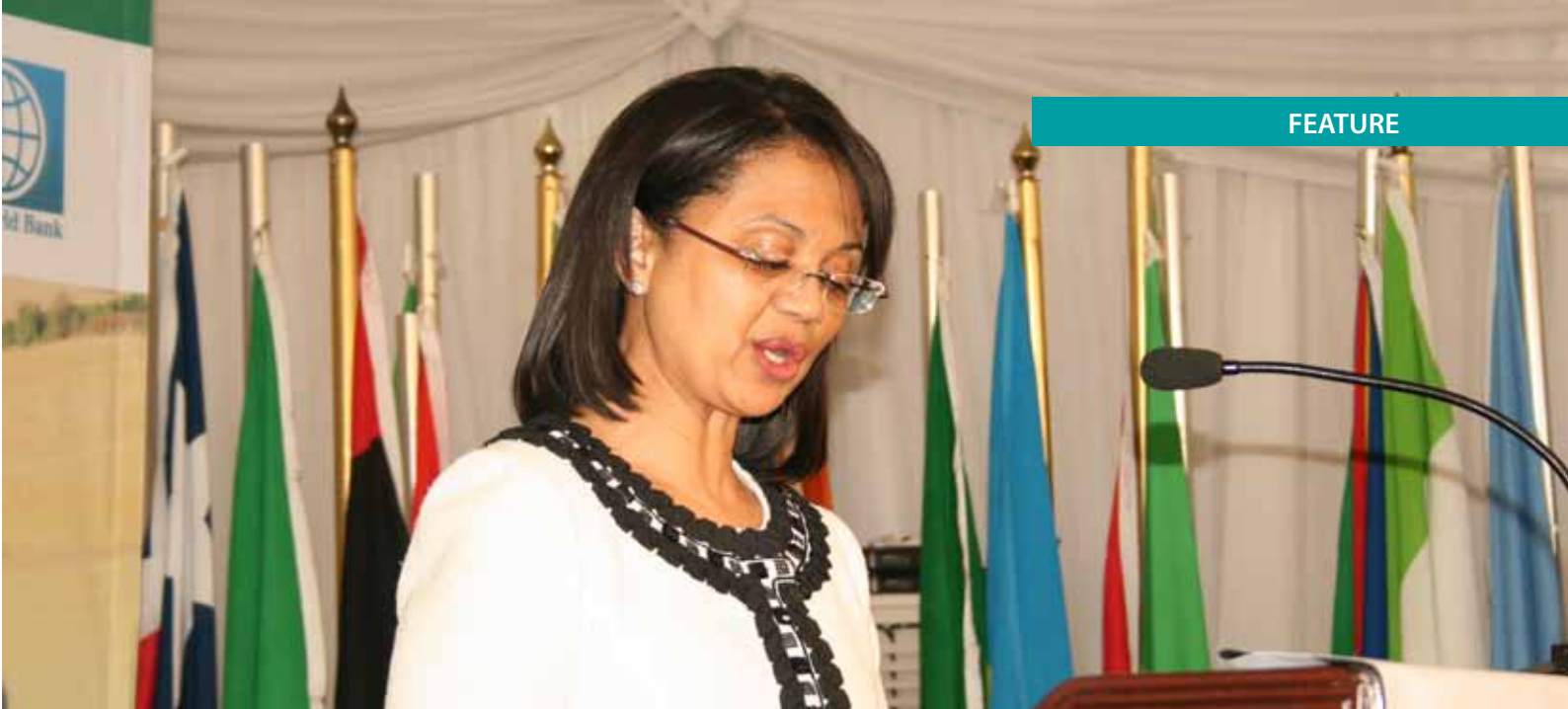
Agriculture, Forestry and Fisheries Minister Tina Joemat Pettersson addressing delegates at the African Ministers Conference on Climate-Smart Agriculture.