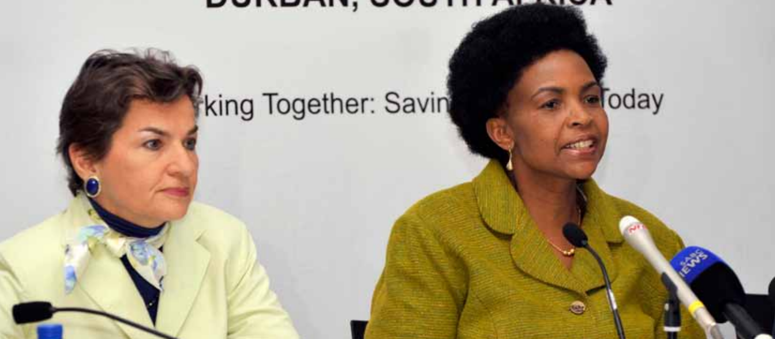
Minister of International Relations and Cooperation Ms Maite Nkoana-Mashabane, with UNFCCC Executive Secretary Ms Christiana Figueres during a press conference after the Pre-COP17 Ministerial meeting.