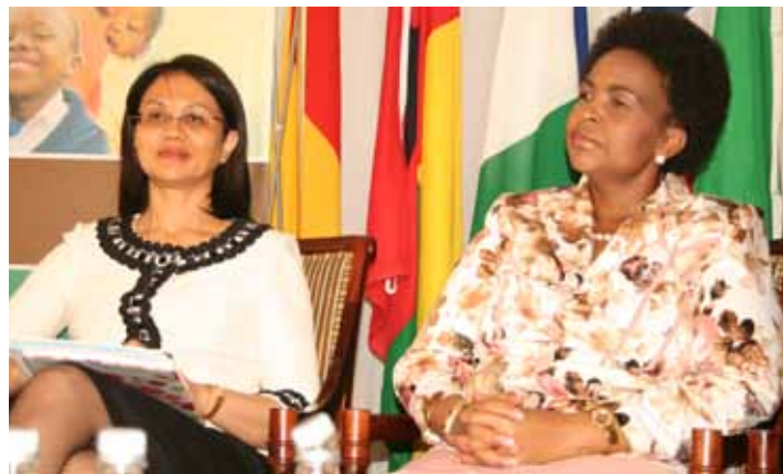
Agriculture, Forestry and Fisheries Minister, Tina Joemat Pettersson, left and International Relations and Cooperation, Minister Maite-Nkoana Mashabane at the African Ministers climate-smart agriculture conference.