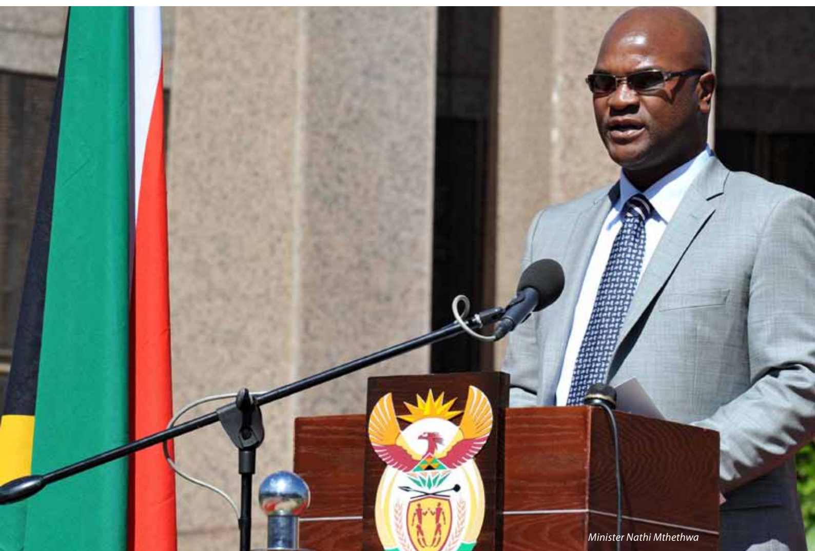
Minister Nathi Mthethwa