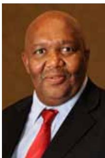
Rural Development and Land Reform: Lechesa Tsenoli