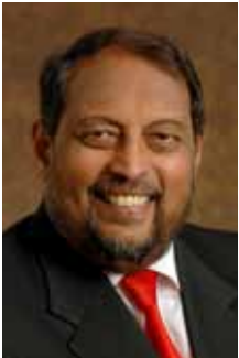
Public Service and Administration: Roy Padayachie