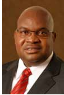
Cooperative Governance and Traditional Affairs: Richard Baloyi