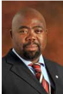
Public Works: Thembelani "Thulas" Nxesi