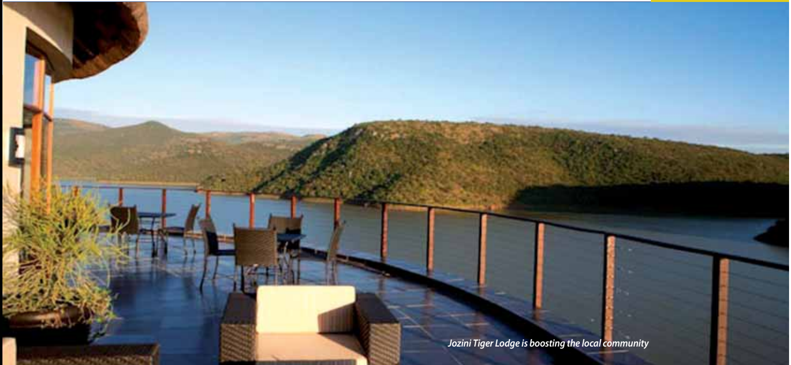
Jozini Tiger Lodge is boosting the local community