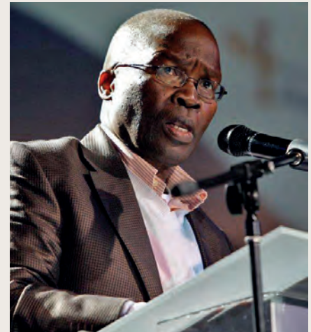
Minister of Transport Mr Sibusiso Ndebele

The Department of Transport hosted a successful International Investors' Conference from 13 to 14 June 2011 at the Cape Town International Convention Centre under the stewardship of Transport Minister Sibusiso Ndebele.