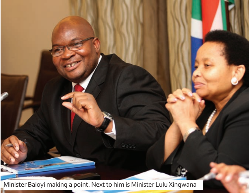
Minister Baloyi making a point. Next to him is Minister Lulu Xingwana

It is time our training interventions reach out to empower our public servants to become foot soldiers of service delivery and be readily available to interact with the people. Maybe it is time we go back to such campaigns as Masakhane, which encourages taking mutual responsibilities in the development of a nation.