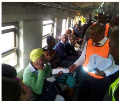
The Premier interacting with train commuters.

On 21 April, Eastern Cape Premier Phumulo Masualle led the Provincial Executive Council on a campaign to tackle attacks on foreign nationals. The move followed a Presidential directive requesting all leaders across the country to engage communities and foster peaceful coexistence between South Africans and foreign nationals.