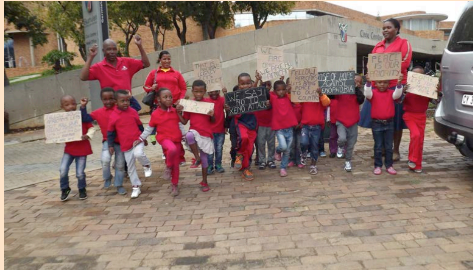
Children from Rose of Hope Early Childhood Development join the call for peace.

Trade and Industry Deputy Minister Mzwandile Masina, Ekurhuleni Executive Mayor Mondli Gungubele and Gauteng Legislature Deputy Speaker Uhuru Moiloa attended a stakeholder engagement dialogue on 22 April. The objective was to mobilise various stakeholders to condemn and support initiatives aimed at curbing attacks on foreign nationals in the City of Ekurhuleni. A pledge was signed in support of government campaign: "We are One Humanity" which seeks to advance social cohesion, national and international solidarity to end attack on foreign nationals.