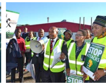
The Premier and other dignitaries interacting with community members during the outreach programme.