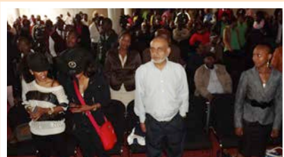
People came in numbers to support the dialogue and show solidarity against attacks on foreign nationals.