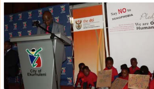
Executive Mayor Gungubele condemns attacks on foreign nationals and urges everyone to advance social cohesion.

Trade and Industry Deputy Minister Mzwandile Masina, Ekurhuleni Executive Mayor Mondli Gungubele and Gauteng Legislature Deputy Speaker Uhuru Moiloa attended a stakeholder engagement dialogue on 22 April. The objective was to mobilise various stakeholders to condemn and support initiatives aimed at curbing attacks on foreign nationals in the City of Ekurhuleni. A pledge was signed in support of government campaign: "We are One Humanity" which seeks to advance social cohesion, national and international solidarity to end attack on foreign nationals.