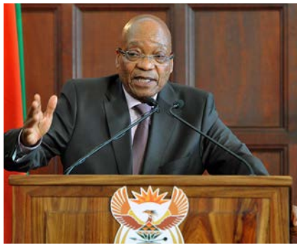
President Zuma addressing various stakeholders.