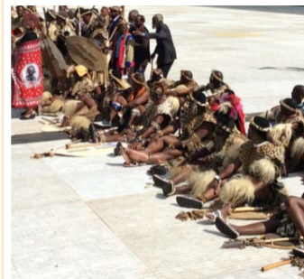
Amakhosi and Izinduna with children from the royal household at the Imbizo.