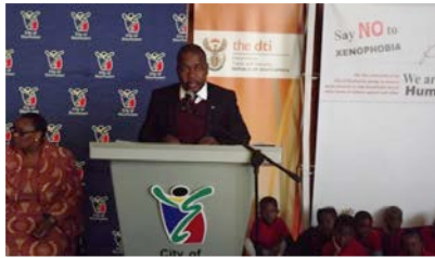
Deputy Minister Masina speaking at the event.