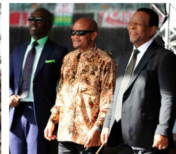
Minister Gigaba, Premier Mchunu and King Zwelithini.