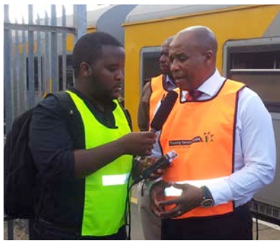
Premier Masualle interviewed by the media after the train activation.