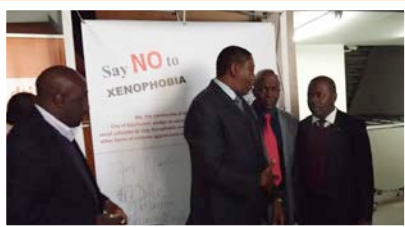
Interfaith Chairperson Pastor Xola Nzo, Deputy Speaker Moiloa, Executive Mayor Gungubele and Deputy Minister Masina after signing the pledge.