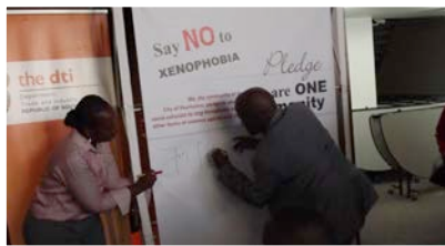
Executive Mayor Gungubele pledging to advance social cohesion by signing the pledge.