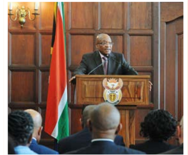
President Zuma engaging with various stakeholders over migration policy.

President Jacob Zuma had a meeting with stakeholders to discuss the country's migration policy and to promote united action to deal with the current challenges facing South Africa.