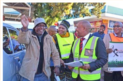
An interaction with taxi drivers and shop owners.

The programme started with a road intersection blitz next to Orient Plaza which was followed by an interaction with motorists, taxi drivers and foreign nationals owning shops. The Premier and his delegation continued the outreach programme in the afternoon with a train activation where political principals interacted with commuters from East London to Berlin station. They condemned all acts of violence and mobilised communities to continue living peacefully with foreign nationals.