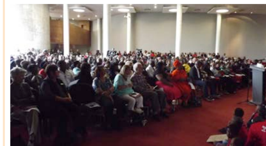
Various stakeholders and community members attended the dialogue.