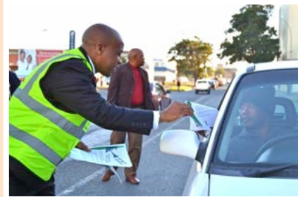
Premier Masualle interacting with motorists during the road intersection blitz.