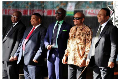
King Zwelithini, Premier Mchunu, Ministers Malusi Gigaba, David Mahlobo and MEC Mike Mabuyakhulu at the event.

An agreement was reached that government should strengthen immigration and trading laws for foreign nationals. Violence against foreign nationals was condemned but government was also urged to consider the concerns of South Africans.