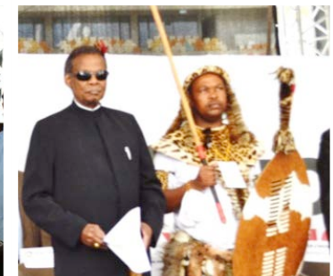
Prince Buthelezi at the Imbizo.