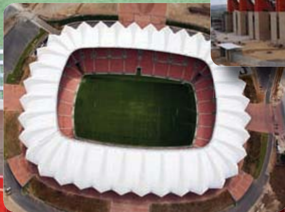
Nelson Mandela Bay Stadium, Port Elizabeth