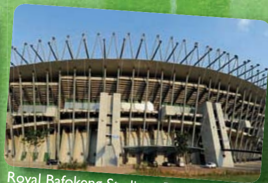
Royal Bafokeng Stadium, Rustenburg