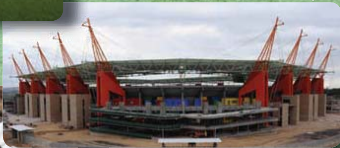
Mbombela Stadium, Nelspruit