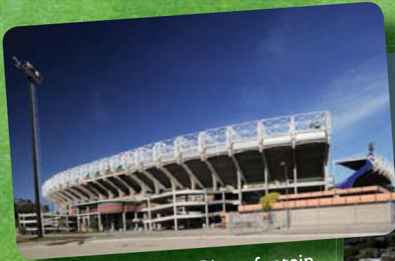
Free State Stadium, Bloemfontein