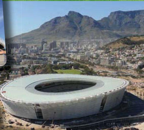
Green Point Stadium, Cape Town