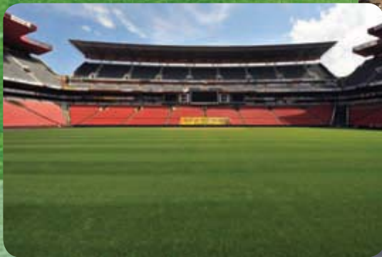
Coca Cola Park Stadium, Johannesburg