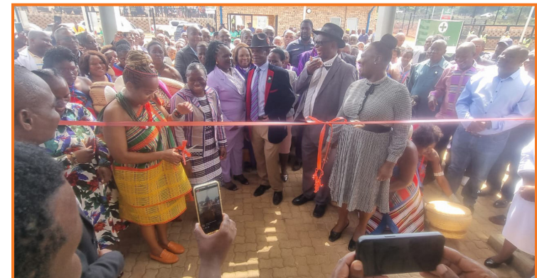
Traditional leaders and government officials joined the community of Thengwe village to celebrate the official opening of the state-of-the-art clinic.