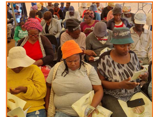
Community members listening to presentations by various stakeholders.