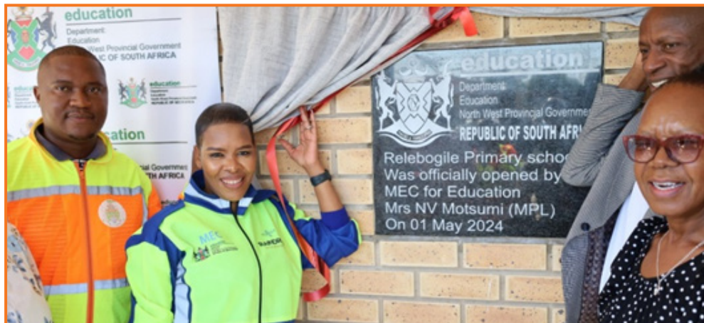
MEC Motsumi and Executive Mayor Manyike during the official opening of Relebogile Primary School.

MEC Motsumi emphasised the importance of safeguarding the school and urged the community of Swartdam village to keep it safe from vandalism. "As we celebrate Workers' Day, let us also reflect on the significance of education in shaping the future for our nation. As the school is for learning purposes, it is also a sanctuary for the workforce. Teachers also deserve better working conditions and that is why we are opening this school on Workers' Day," she said.