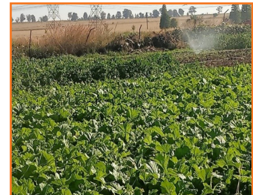
The 300-ha Agri-Park being developed on land donated by SASOL to the DARDLEA.