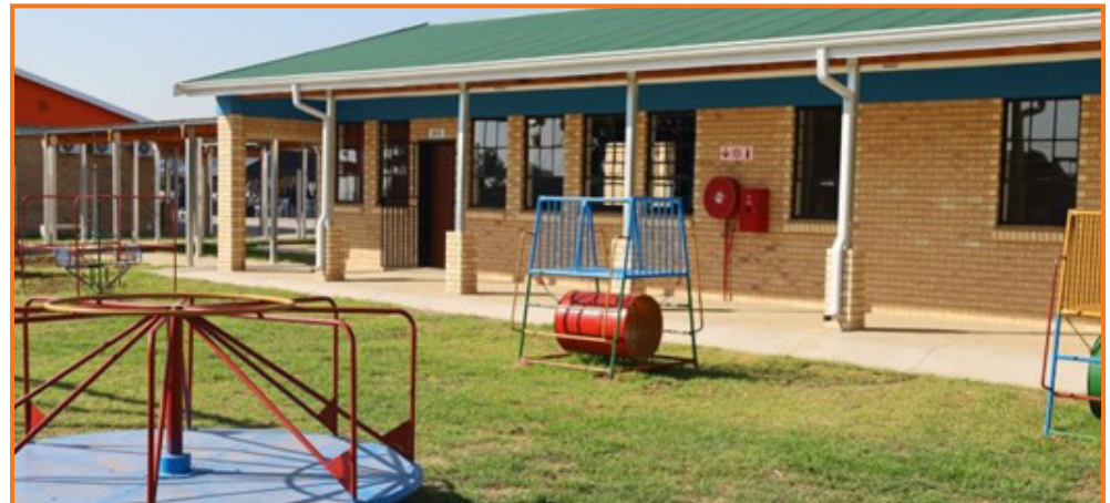
The new Relebogile Primary School in Swartdam village.