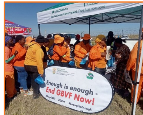
Community members hungry for government information at the GCIS stall.