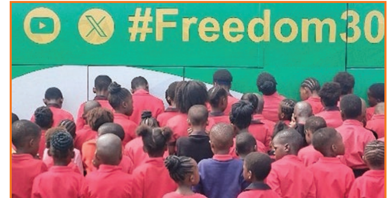
Learners of Vuka Primary School waiting to get onto the Democracy Bus.