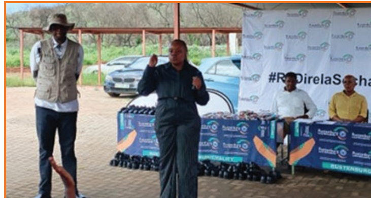
GCIS officials talking to learners about 30 Years of Freedom and Democracy.