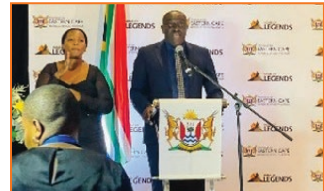
MEC Gade presenting a report on the performance of the Class of 2024.