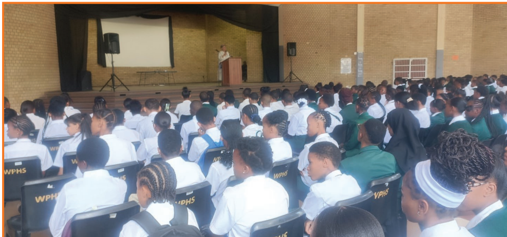
Learners at William Pescod High School assemble in the hall to listen to the speakers.