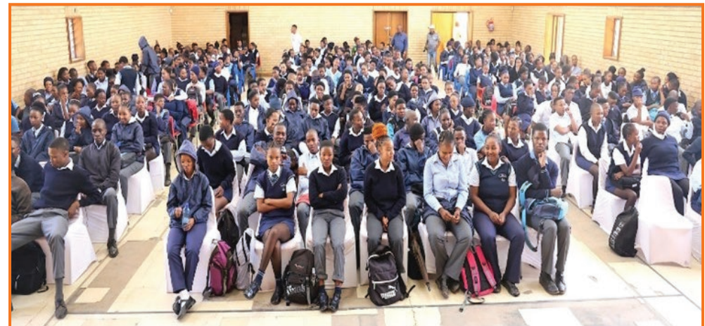
Mamello Secondary School learners in attendance at the Back-to-School campaign.