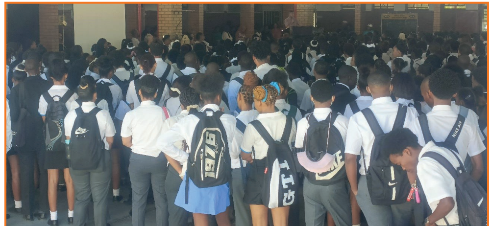
Floors High School learners listen to motivational talks from former learners of the school.