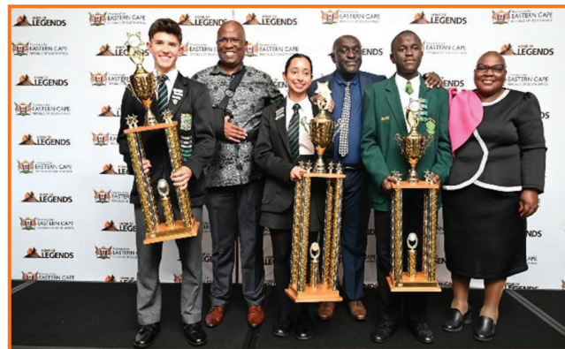
Premier Mabuyane and officials from the ECPG with the top achievers.