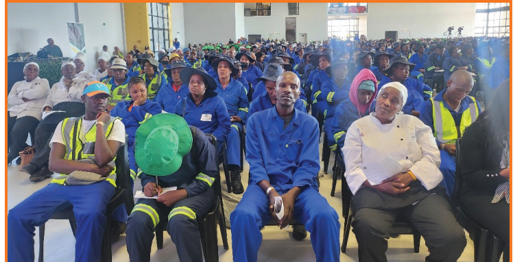
The youth attending the launch of the learnership programme at the Thabong Thusong Service Centre.