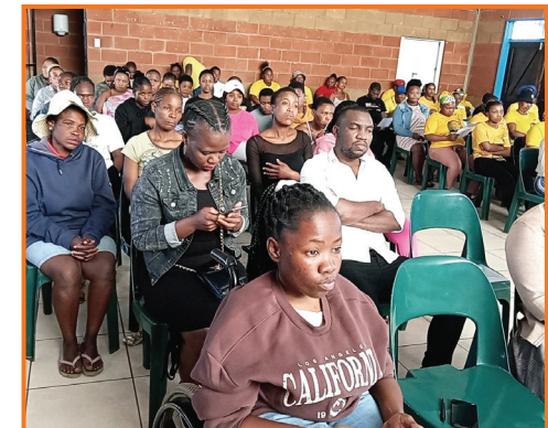
Some of the participants who attended the entrepreneurial workshop.