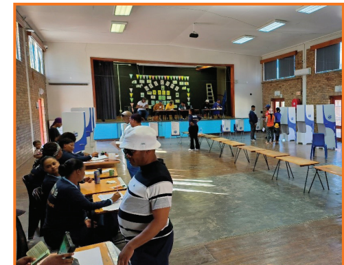
Beaufort West Primary School voting station, one of the biggest in the Central Karoo, in full operation.