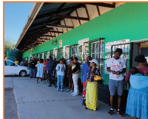
People queue patiently at the Khanyisa Day Care Centre voting station to cast their votes.