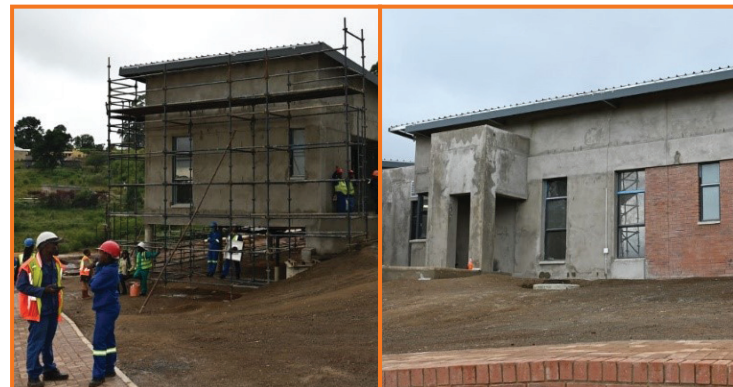
Construction of the hospital is underway.

“In these types of projects, we want to see community beneficiation, and employment of young people, women and local SMMEs,” said Deputy Minister Kekana. She further stated that their monitoring visit was to also ensure that a quality infrastructure is built.