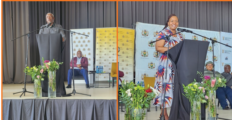
Then Premier Dukwana and Deputy Minister Moloi addressing the Free State youth.