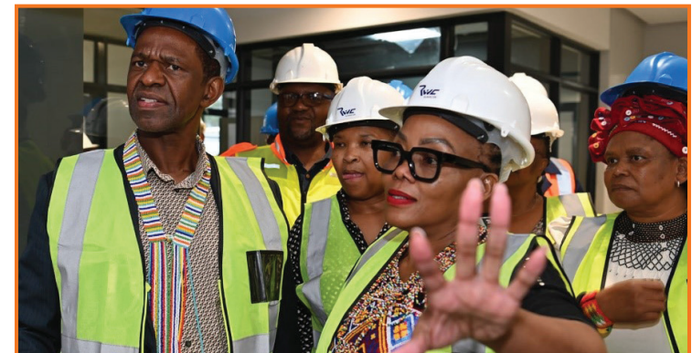
Deputy Minister Dhlomo and Deputy Minister Kekana during their visit to the hospital to assess progress.