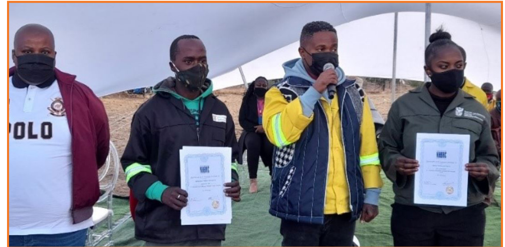
Two young people holding NHBC certificates that were issued to them for their participation in the construction project.

On 24 June 2021, the Bakoena Royal Council in QwaQwa held a “Youth Build Housing” handover ceremony in partnership with Youth Build and the Department of Human Settlements.