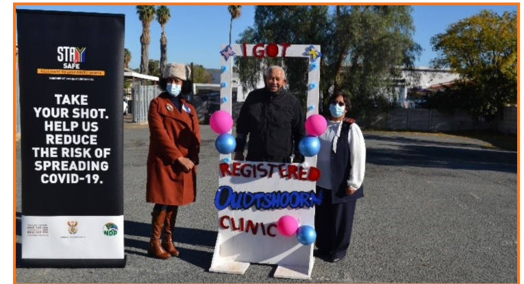
Senior citizens, health workers and stakeholders who were part of the vaccination registration day at the Oudtshoorn Clinic.