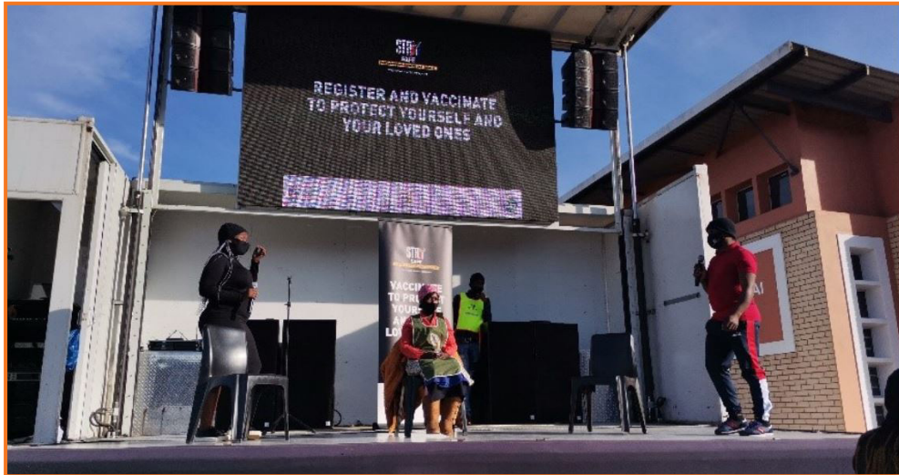
A drama act on COVID-19 vaccine registration by the Tsitsikamma Bright Stars.

By Noluvuyo Mangweni: GCIS, Eastern Cape