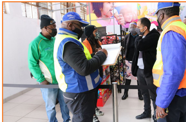
Gauteng Department of Economic Development officials engaging a shop owner on compliance issues.

“I appreciate the information that was given to me in ensuring that my shop complies with the COVID-19 regulations.”