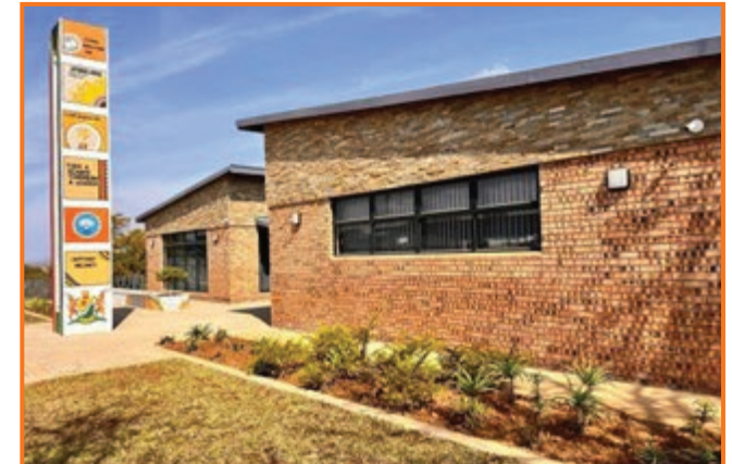
Matsamo Public Library.