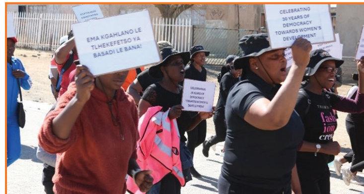
March by the communities of Namahadi and Frankfort against GBVF led by local stakeholders.

Namahadi was identified to host the event after it was flagged by the South African Police Service and the DSD as one of the hotspots for domestic violence and gender-based crimes. Respective government departments presented their plans and measures currently in place to combat ongoing crimes against women and children, while represented civil society organisations identified certain gaps and shortcomings of those measures. They also raised awareness regarding poor understanding of GBVF by victims, poor monitoring and evaluation of liquor licensing compliance by authorities, sluggish suspect tracing, minimal to poor police visibility due to lack of police vehicles and poor administration of protection orders by the responsible government departments.