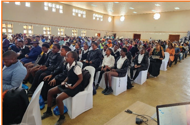
Learners and parents who attended the opening of the library learn more about the establishment of Matsamo Friends of the Library.