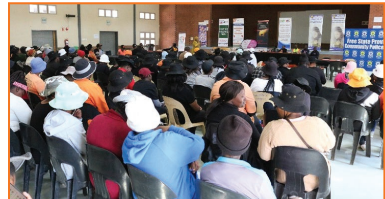
Community dialogue in session at the Falesizwe Secondary School hall.