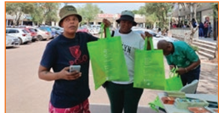
Community members appreciated the crucial information shared by GCIS officials during the activation.