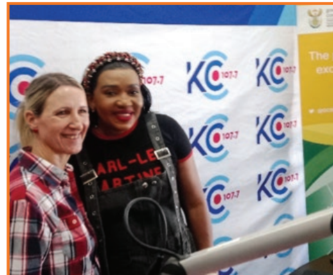
Radio KC and the GCIS worked together to profile the work of the DHS.