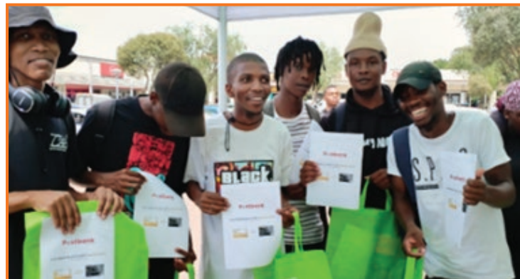
Members of the community were happy to receive GCIS bags and SASSA leaflets.

The residents expressed gratitude to government for keeping them updated on its plans and programmes, and requested that similar activations be conducted regularly.