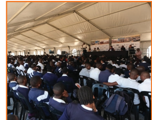
More than 2 000 learners attended the career expo in Paarl.