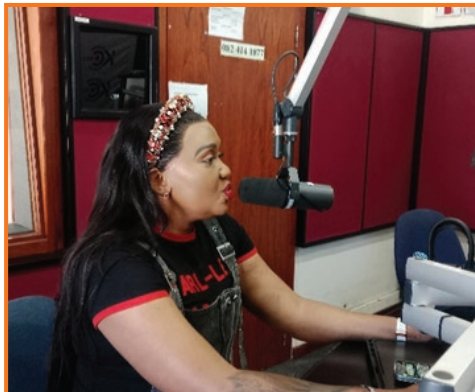
Deputy Minister Mahambehla at Radio KC.

The Government Communication and Information System (GCIS) arranged radio interviews with Radio KC and Paarl FM for both deputy ministers, to amplify the role of their respective departments as well as available opportunities that young people can access.