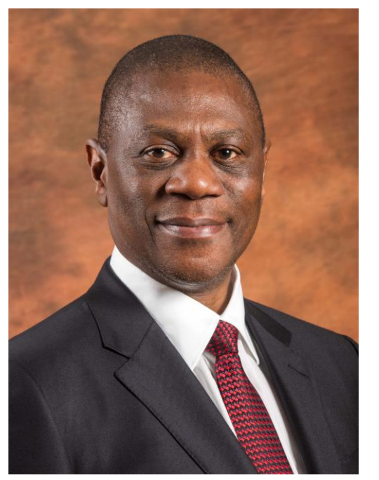
The Deputy President