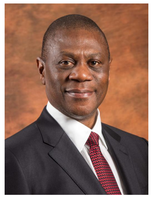
The Deputy President

Three photos: the most senior in middle; the second to the left of the viewer; the third to the right of the viewer.