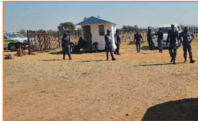
South African Police Service members arriving at the venue.