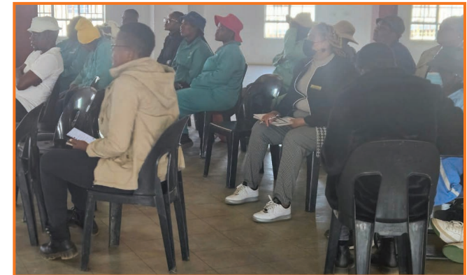
Community members viewing the Presidential Inauguration.