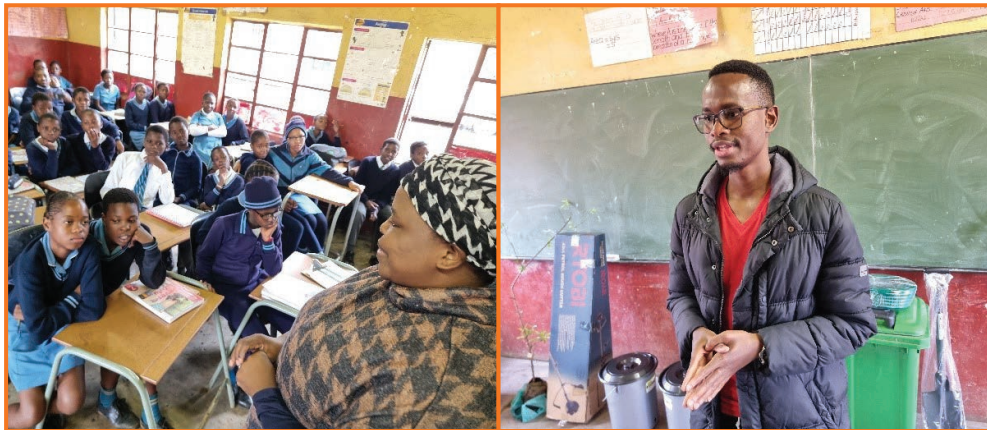
Environmental awareness and Freedom Month information-sharing sessions underway at Ophathe Primary School in Muden.

“We are forever grateful as Ophathe Primary School to have such a caring government for our learners.”