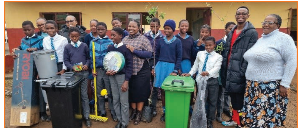
The learners displaying some of the goods donated by the KwaZulu-Natal DEDTEA.