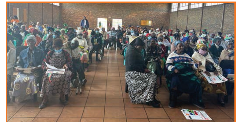
Older persons and people with disabilities attended the Presidential Inauguration public-viewing session at the Mbibane Community Hall at the Dr JS Moroka Local Municipality.