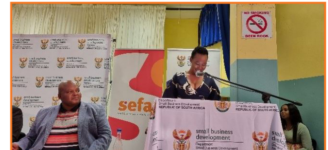
Minister Stella Ndabeni-Abrahams addressing small business owners.

MEC Vosloo urged small enterprises to take advantage of services provided by the department and reposition themselves to access funding and other incentives offered by government and finance development agencies.