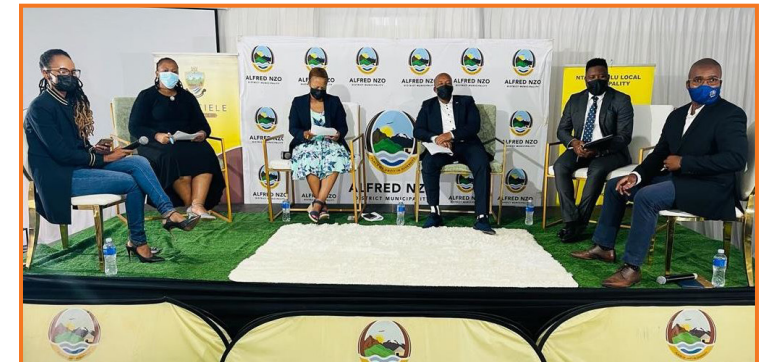
Service delivery panel discussion hosting different mayors.

Community members asked about specific service delivery projects in their communities directly to their mayors and they were responded to.