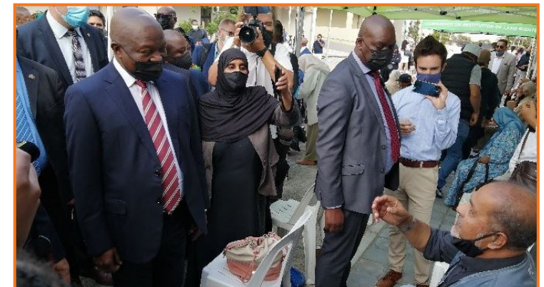
Deputy President David Mabuza engaging with one of the claimants.