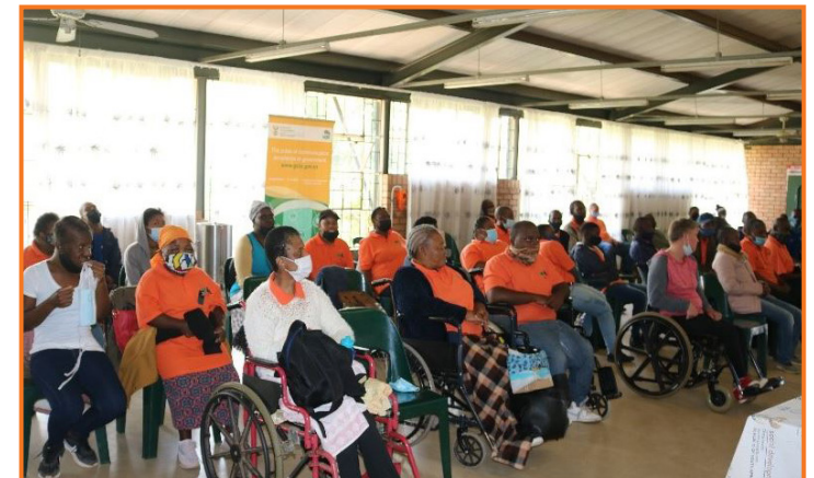
Community members who attended the human rights awareness campaign at Mamelodi Disability Centre.

The Bill of Rights is a cornerstone of democracy in South Africa and it enshrines the rights of all people in the country, including persons with disabilities and also affirms the democratic values of human dignity, equality and freedom.