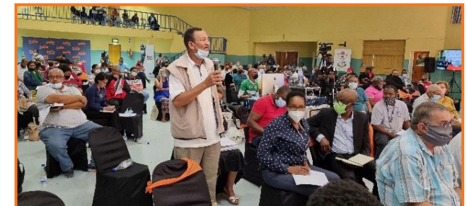
Small business owners were afforded the opportunity to ask questions.