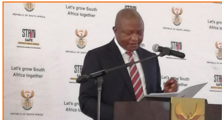
Deputy President David Mabuza addressing the audience.