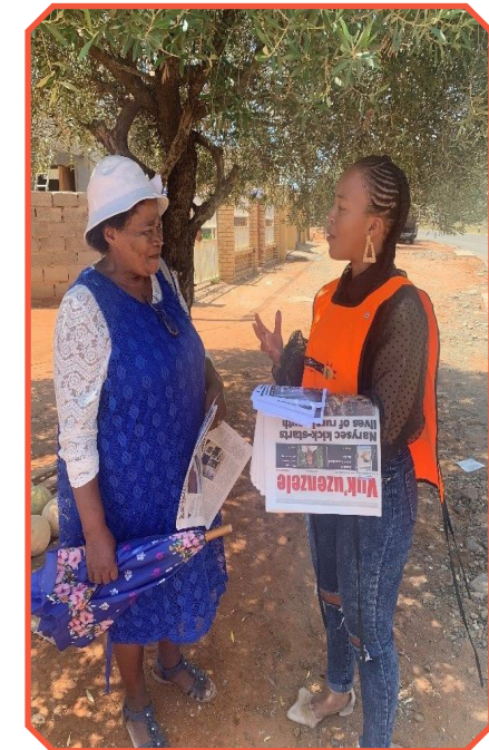
Government officials engaging with the community of Galeshewe.