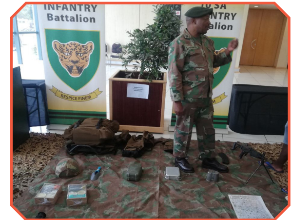
SANDF exhibitions at the event.