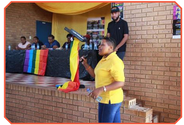
One of the stakeholders addressing the community.