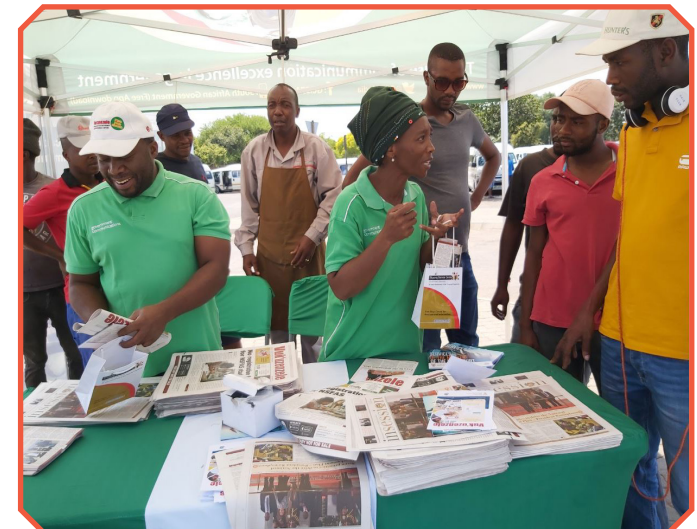
GCIS officials distributing information materials to community members.