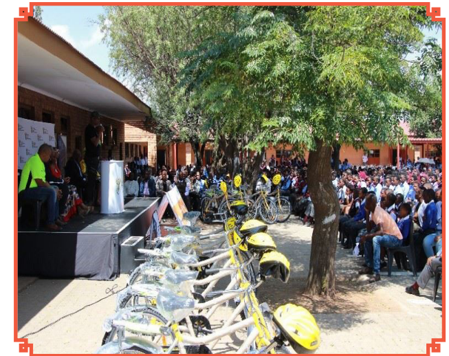
The handover of bicycles to school learners.