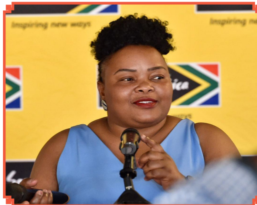
Deputy Minister Thembu Siweya addressing the youth.

Deputy Minister Siweya encouraged young people to take initiative. "Start something with the idea that you have so that when an opportunity arises you move to higher level. Start small and expand because government, through different entities, is more than ready to assist those who are prepared to work. Start something, start small," she said.