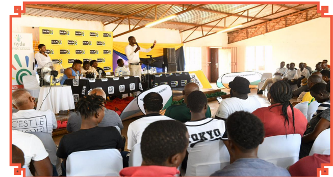
Stakeholders addressing young people at the event.