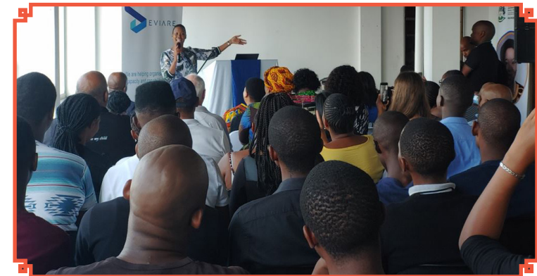
Minister Stella Ndabeni-Abrahams addressing the students at the KwaZulu-Natal Data Science and 3D Printing Skills Programme.