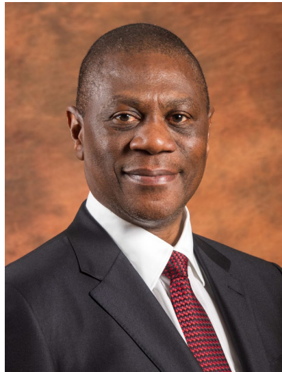
The Deputy President