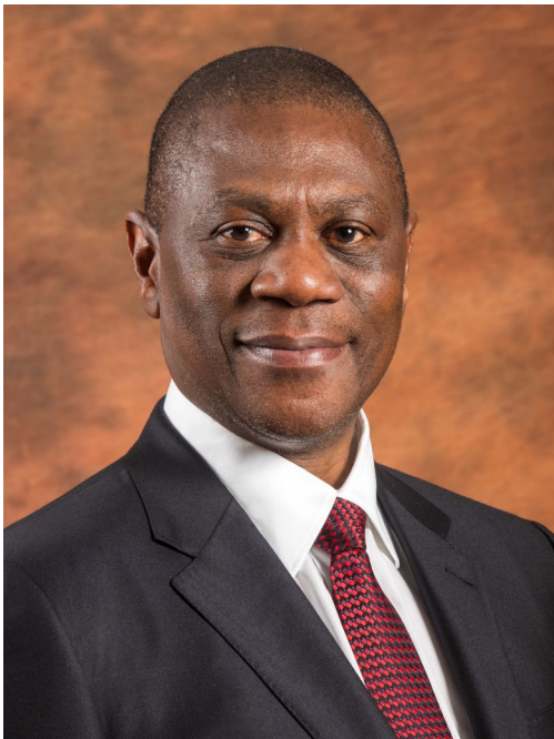
The Deputy President

Three photos: the most senior in middle; the second to the left of the viewer; the third to the right of the viewer.