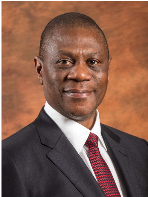
The Deputy President

Three photos: the most senior in middle; the second to the left of the viewer; the third to the right of the viewer.