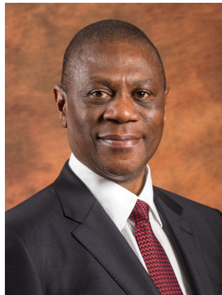
The Deputy President