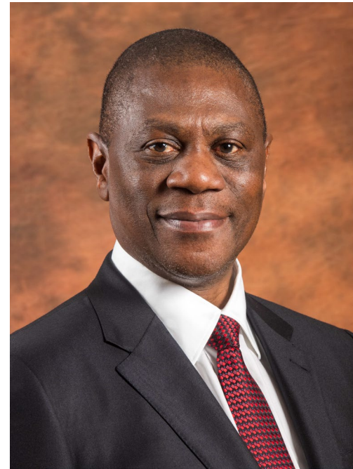
The Deputy President