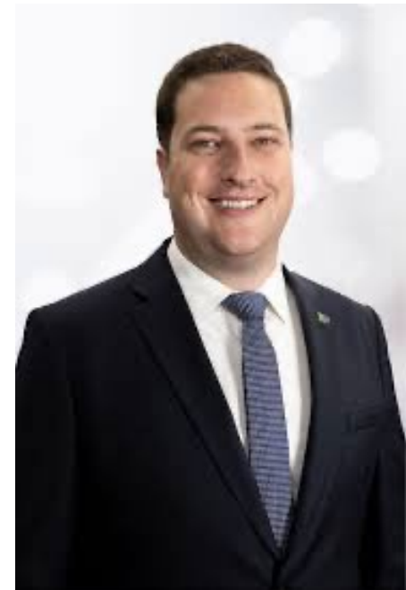
The Executive Mayor