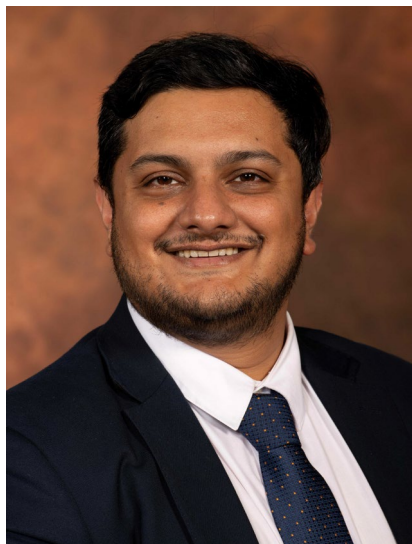
The Deputy Minister

Four photos: the most senior in middle; the second to the left of the viewer; third to the right of the viewer and fourth to the far left of the viewer.