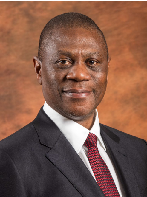
The Deputy President

Three photos: the most senior in middle; the second to the left of the viewer; the third to the right of the viewer.