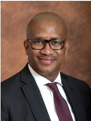
The Deputy Minister

Five principals, when all the deputy ministers are also included: the most senior in middle; the second to the left of the viewer; the third to the right of the viewer; the fourth to the left of the viewer and the fifth to the right of the viewer.