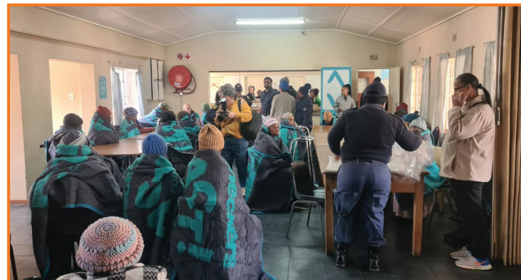
The elderly wearing their new blankets donated by the stakeholders.