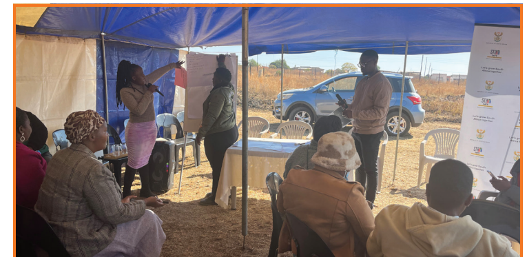
Some of the people attending the anti-substance abuse dialogue at the Thembisile Hani Local Municipality.