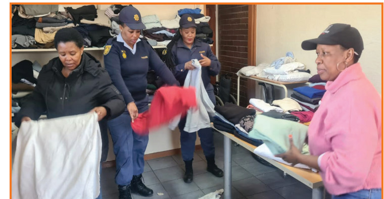
Stakeholders cleaning the home for the elderly.