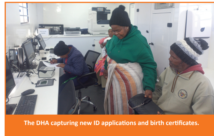
The DHA capturing new ID applications and birth certificates.